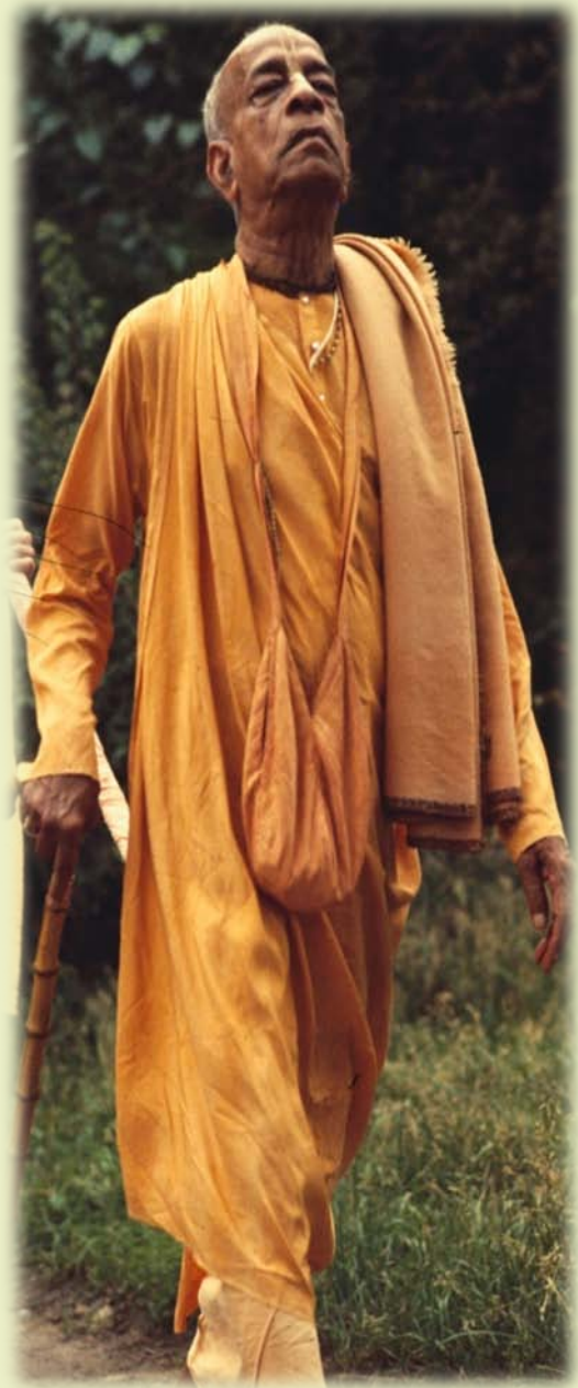
Srila A.C. Bhaktivedanta Swami Prabhupada

“As we moved along the park’s winding path, Prabhupada took each step decisively, first testing the ground with his cane to insure that the footing was solid. Some of the snow had melted, forming puddles of water, but the freezing temperatures of nighttime had created a thin coating of ice over the water. Each time we came to a puddle of ice, Prabhupada would stop and, gripping his cane firmly, smash it down upon the ice. It was something that a child would have done, and yet Prabhupada’s expression remained grave. After he repeated this for a fourth time, I inquired what the purpose behind it was. Prabhupada looked from the broken pieces of ice to explain, “This ice is maya. The natural state of water is liquidity. Now it has become hard. And just as we have to apply heat to melt the ice, similarly, by applying the mahamantra , the hard hearts of the materialists will melt.” And Prabhupada walked on, smashing each puddle, breaking maya’s back. To break each and every frozen puddle was an expression of Prabhupada’s firm determination not to allow maya’s icy grip a single foothold...In the distance we saw an old man giving dried crumbs of bread to a flock of birds. Prabhupada remarked that just like with this old man, it is a natural propensity of everyone to render service to someone or something. But only by directing our service to Krsna can we actually become happy.”