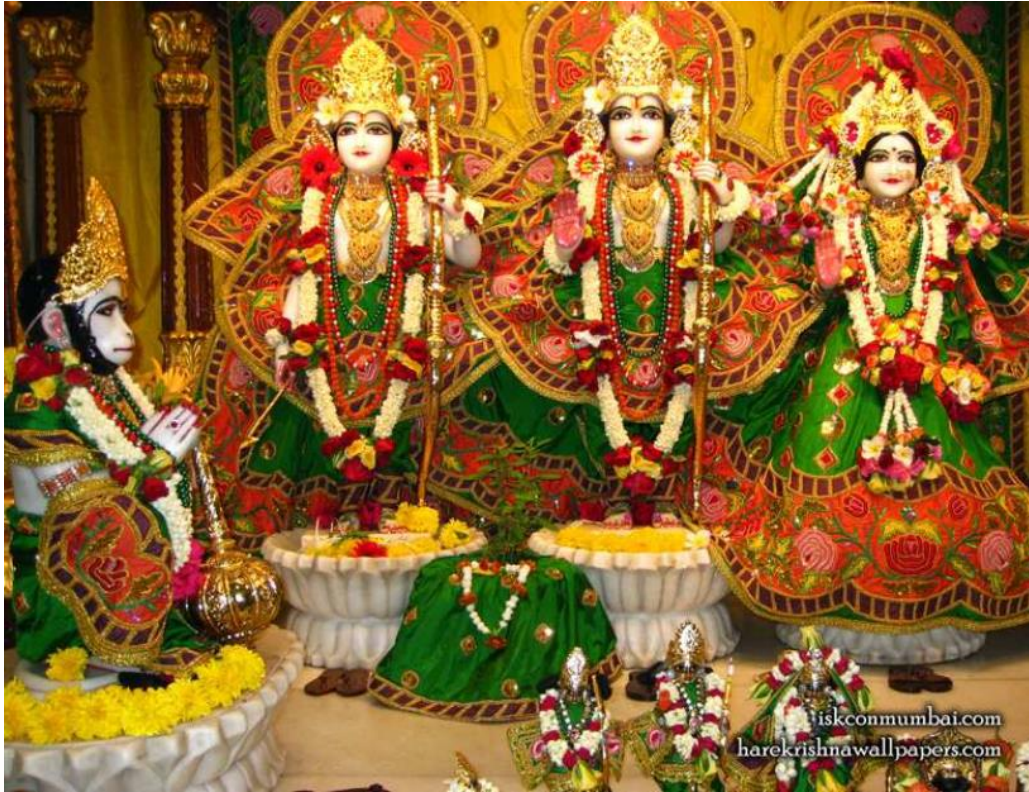
Shri Shri Sita-Rama, Lakshmana, Hanuman, Hare Krishna Land, ISKCON Mumbai.

(*14) “Dowers” is an archaic English term denoting “gift,” and is the basis of the world “dowry.” From the very birth of Lord Rama, Rama Navami, has been observed yearly for millions of years. At the time of His appearance the demigods rained all auspiciousness upon the earth.