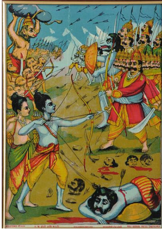
Lord Rama appeared for the destruction of the demon Ravana

And Queen Kaikeyí bore a child Of truest valour, Bharat styled, With every princely virtue blest, One fourth of Vishnu manifest.