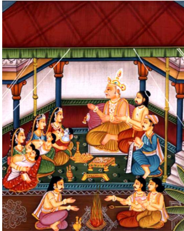
King Dasharatha, his three queens, and the birth of their four sons (though born at different times)..

Rama, the universe's Lord, A prince by all the worlds adored. New glory Queen Kaushalya won Reflected from her splendid son.