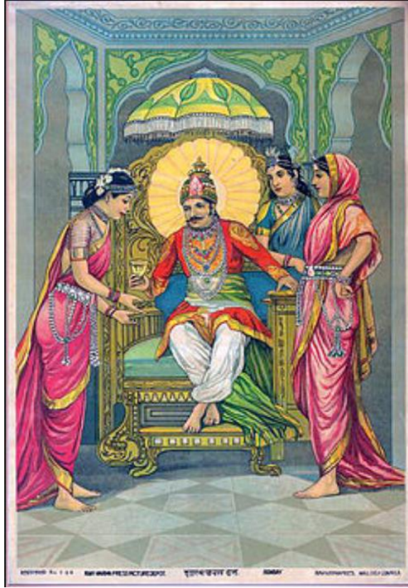
The generous King Dasharatha with his three queens: Kaushalya, Sumitra and Kaikeyi.

Rama, his sire's supreme delight, Like some proud banner cheered his sight, And to all creatures seemed to be The self-existent Deity.