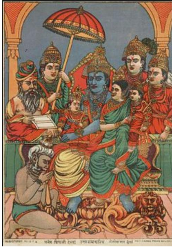
Lord Rama with His brothers Lakshmana, Shatrughna and Bharata. Queen Sita along with sons Lava and Kusha. Sage Valmiki holds Ramayana and Hanuman kneels before the throne.

What time the Moon had gone to make His nightly dwelling with the Snake. (*12) The high-souled monarch's consorts bore At different times those glorious four,