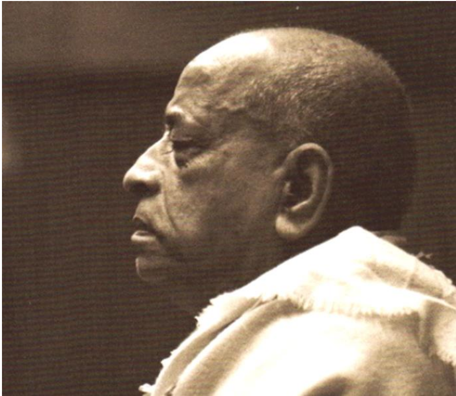
His Divine Grace A.C. Bhaktivedanta Swami Prabhupada ... His loving smile conquered the world.

Mithuna Twiins Astrological Services “Home of Shri Shri Radha-Dharmeshwara and the Bhrgu Project”