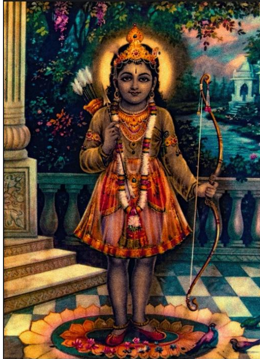
Rama, the world's dear paragon.

The world's delight and darling, he Loved Lakshman best from infancy; And Lakshman, lord of lofty fate, Upon his elder joyed to wait,