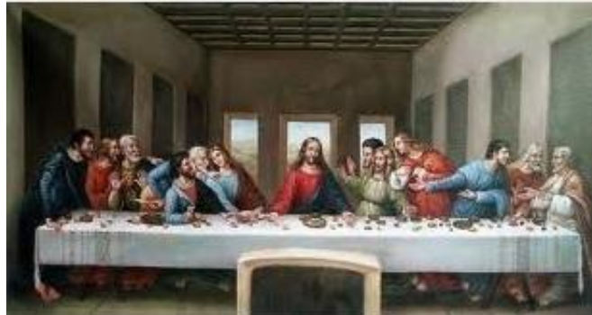
The Last Supper: Lord Jesus Christ with His Twelve Apostles

Yet the teachings of Jesus Christ had spread far and wide, becoming a thorn in the side of the Roman Empire where the worship of the solar deity Varuna Aditya as Mitra had grown in force. Similarly the cult of Mitra or Mithras had also spread throughout the areas known today as Egypt and Greece. Thus a form of Christianity emerged from out of the worship of the Sun god. What Jesus had taught about the worship of Vishnu or Krishna now had to be assimilated as seamlessly as possible into the doctrine of Mitra worship. Thus was invented a form of “Christianity” which observed its main celebrations in accordance to the Sun worship. As further evidence, we see that even though the Bible advises to “keep the 7 th day” (meaning leave each Saturday aside for worship), the Christians (except for the modern 7 th Day Adventist sect) worship on Sunday, the ancient “day of the Sun” which is traditionally when yagnas to the Sun god are offered.