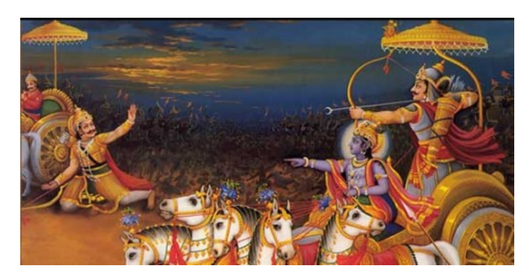
Shri Krishna tells Arjuna to slay Karna, thus fulfiling Karna's dark prophetic vision

(Lord Shri Krishna, the Supreme Personality of Godhead, replied) Indeed the destruction of the earth is at hand when My words, O Karna, have not been heeded by you. O sire, when the destruction of all creatures approaches, wrongfulness assuming the semblance of righteousness leaves not the heart.