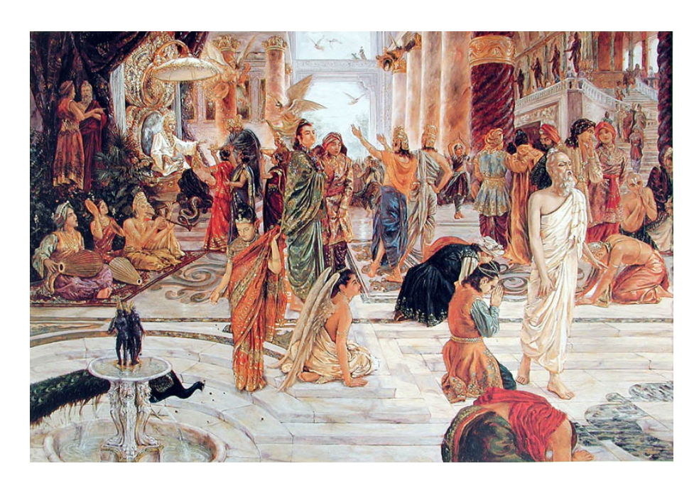
Brihaspati, the deity of planet Jupiter, departs the court of King Indra, who has offended him. (SB 6.7.10)

purodhasam cha mukhyam mam viddhi partha brihaspatim