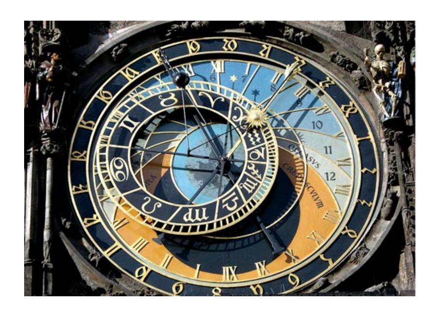
Installed in 1410, the Orloj is Prague's chief tourist attraction