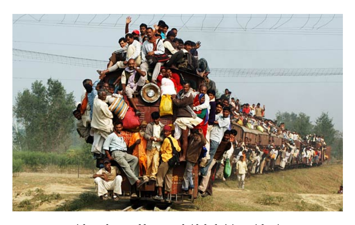
ishvarah sarva-bhutanam hrid-deshe'rjuna tishtati bhramayan sarva-bhutani yantradhani mayaya

"The Supreme Lord is situated in everyone's heart, O Arjuna, and is directing the wanderings of all living entities, who are seated as on a machine, made of the material energy." ( Bhagavad-gita 18.61) •