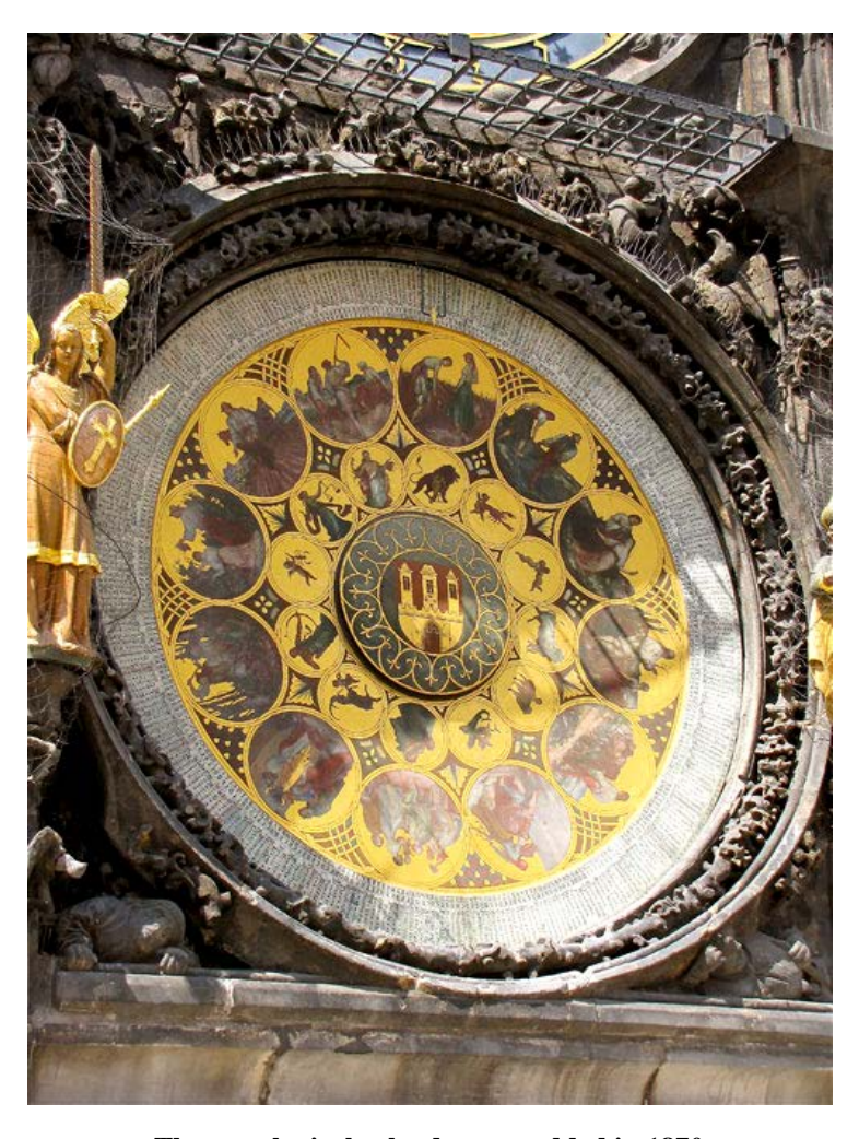
The astrological calendar was added in 1870

angels. The Orloj stirs the imagination, but only the enlightened devotees can recognize the obvious fact that the clock is a mechanical representation of the subtle energies of the Supreme Lord Sri Krishna. • -written 23 Feb. 2012