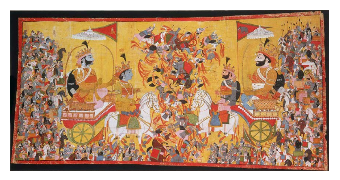
[The Supreme Lord spoke:] "Do thou fight for the sake of fighting, without considering happiness or distress, loss or gain, victory or defeat-and, by so doing, you shall never incur sin." Bhagavad Gita As It Is 2.38

A disciple once asked Srila Prabhupada if the American soldiers who fought in WWII would achieve the destination of noble kshatriyas , the Sun planet. No, Srila Prabhupada replied. How was it possible when they were fighting for sense gratification? As we can see from the poetic revelations of Gen. Patton, dying on the battlefield for non-religious reasons only leads to further misery in the repeated cycle of birth and death. • written 31 Dec. 2011