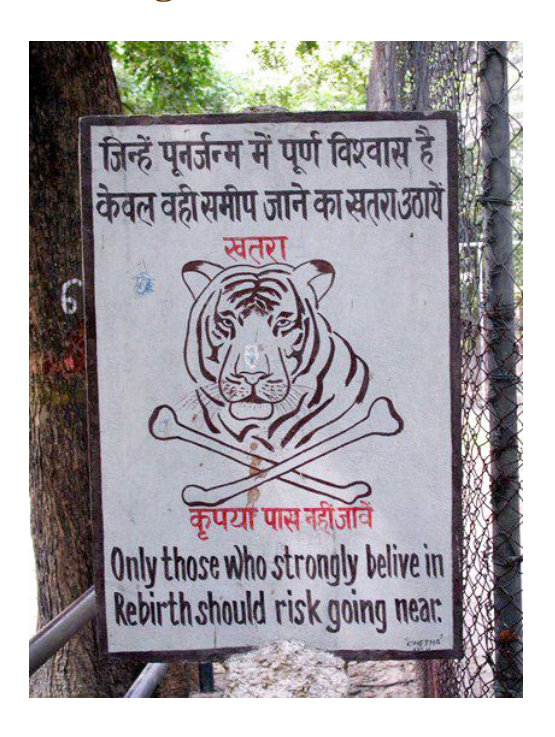
sri bhagavan uvacha bahuni me vyavtitani janmani tava carjuna tany aham veda sarvani na tvam vettha parantapa

"The Blessed Lord said: Many, many births both you and I have passed. I can remember all of them, but you cannot, O subduer of the enemy!" (Bg\ 4.5)