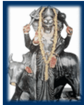
Right: Deity of Lord Shanideva, Kokilavana, Koshi, UP

The big news of the zodiac is that Saturn will soon change signs from Virgo into Libra on 15 th Nov. 2011 at 03:15:22 GMT. This means that Saturn will be moving in Tula rashi , where he is exalted or uccha , for the next nearly 3 years. Saturn will stay in Libra until 3 Nov. 2014 (except for a short stretch when Shanideva retrogrades back into Virgo from 16 May till 4 Aug. 2012).