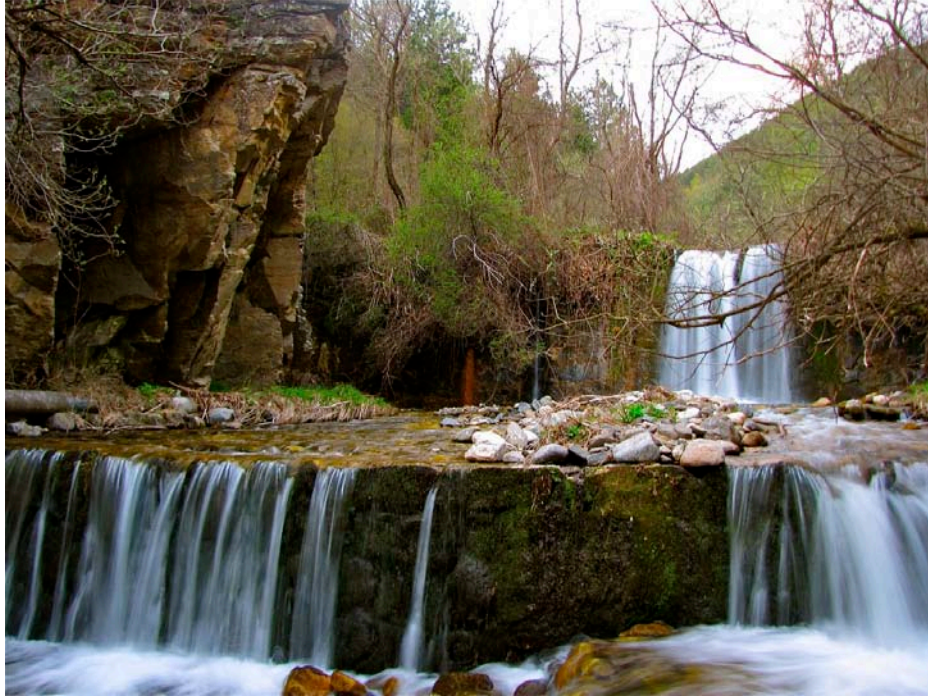
Pure water flows from the Rila Mountains, Blagoevgrad, into the Bistritsa River.

These astonishing effects – and more – are obtained only by drinking the most common liquid on our planet, namely water. Raso'ham apsu kaunteya . Water is so sacred that its very essence, its taste, represents Lord Krishna. But this is a taste missed by the average person who drinks all sorts of liquids like coffee, tea and juices but hardly remembers his intake water. We assume that all liquids are created equal without realizing that we can suffer dehydration if we do not drink water. Even if we drink the best quality of juices they would never equal the benefits that water provides. Pure water has specific qualities that other liquids simply do not have. One interesting reference to the amazing properties of water is found in Srimad Bhagavatam . There is given the story of Indra suffering the reactions of killing the brahmana Vishvarupa: