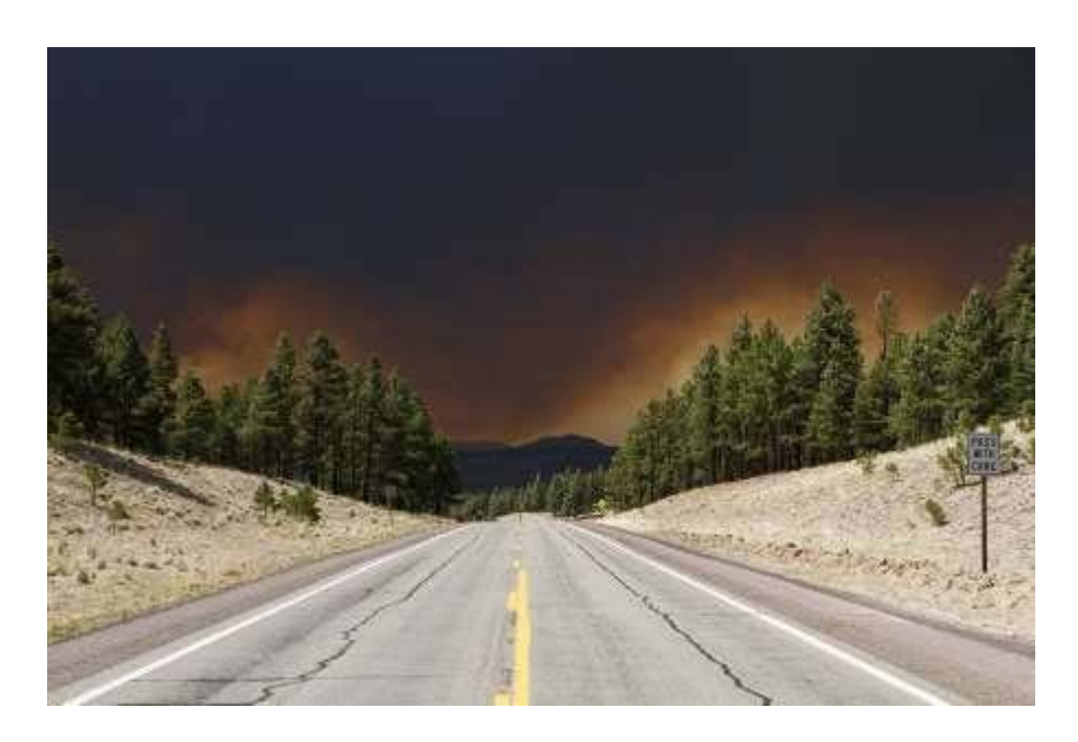
The road to Rahu: The North Node's smoky curtain lingers over huge portions of AZ and NM

<u>8 June</u>: A major fire scorching tens of thousands of acres also caused evacuation near Fairbanks, Alaska.