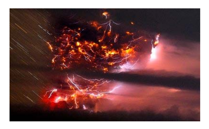
Storms of Rahu and Ketu: Lightning over Chile's volcano

<u>5 Jun:</u> Chile volcano erupts, airports are later closed, flights cancelled. (http://news.yahoo.com/nphotos/Volcano-erupts-Chile/ss/events/wl/060611chilevolcano).