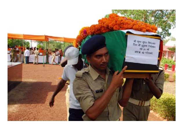
Rahu's terror: Indian policemen carry the remains of their fallen comrades killed in the line of duty by Maoist rebels.

10 Jun: At least 15 Indian police are killed in Maoist violence in Chattisgarh. (http://english.aljazeera.net/news/asia/2011/06/201161051539413728.html)