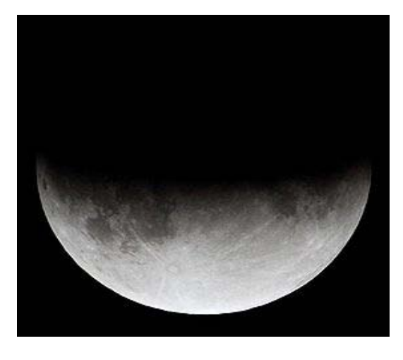
karmic retribution. Dark seeds of thorny bushes now bear sinful fruits for culprits who can hide no longer. This does not take great skill to understand. It is like predicting that night follows day. The ominous nature of eclipses and comets are common sense. Mix the two and real trouble develops. Chant Hare Krishna and the trouble goes away. It's that easy

We are now in the abyss of two eclipses. Because both eclipses and a comet are presently active, it is understood that the mischief of both Rahu (eclipses) and Ketu (comets and meteors) are afoot. Srila Prabhupada once compared a comet to a policeman who comes looking for a criminal.