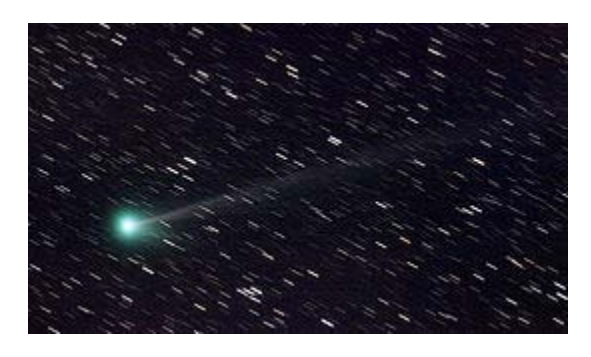
Comet Mc Naught (C 009 R1) June 2010

We are now in the abyss of two eclipses. Because both eclipses and a comet are presently active, it is understood that the mischief of both Rahu (eclipses) and Ketu (comets and meteors) are afoot. Srila Prabhupada once compared a comet to a policeman who comes looking for a criminal.